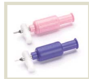
Luer inlet models 375/20PLS and 375/22PLS