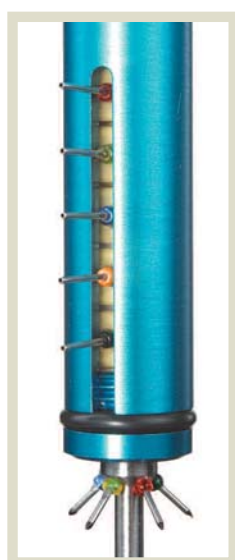
Channels are color coded to match inlets and outlets

To solve these problems Instech kept the seals tight but added a motor to assist the rotation. A controller senses the animal's movement and drives the swivel core to follow the animal. Unlike switch-based systems, this swivel features a proportional control, allowing fine continuous movement to minimize stress on the animal. The torque felt by the animal is similar to that of an Instech single channel swivel. This power-assisted proportional control technology was first introduced in 2000 in Instech's patented Swivelless Swivel™, but is applied here to a swivel that hangs above caging of the researcher's choice.